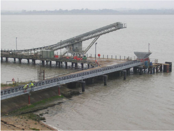
Dockside ship unloading application