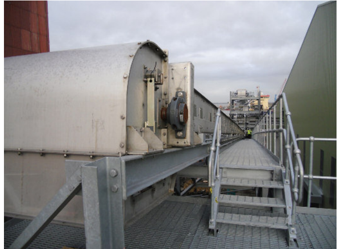
Guttridge Kleenbelt handling fertiliser on a dockside installation