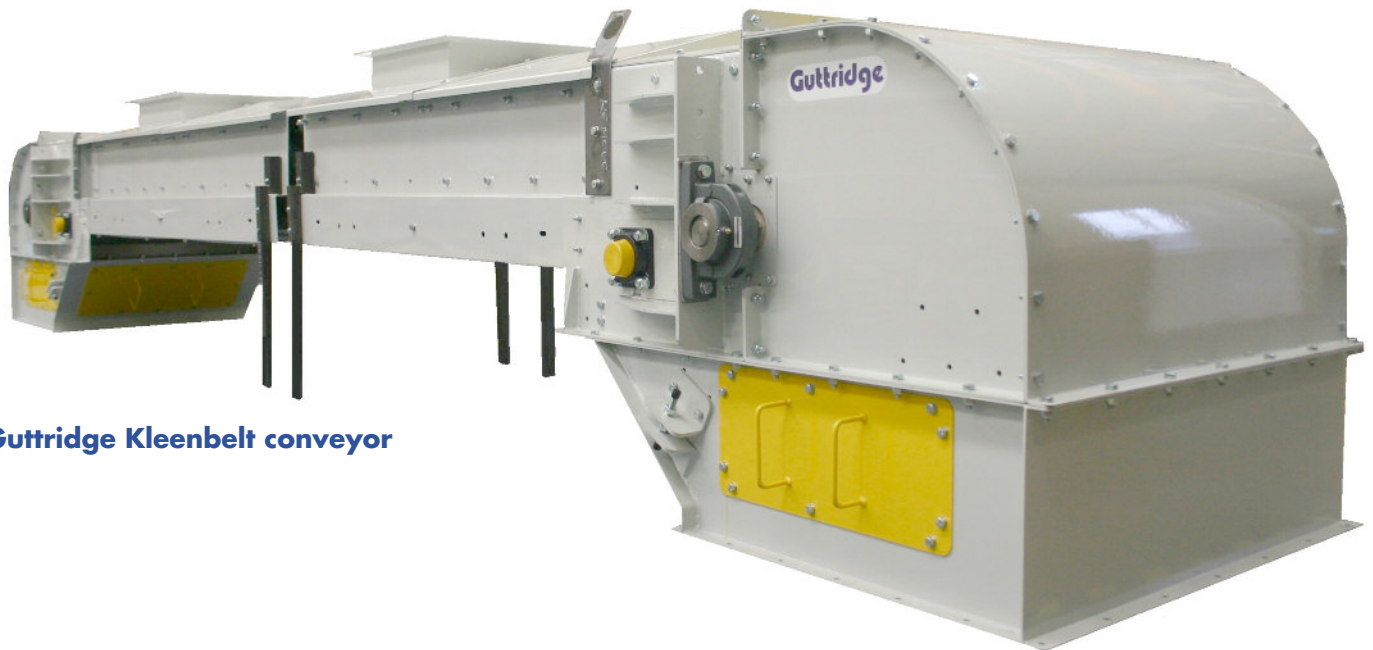
Guttridge Kleenbelt conveyor

Belt Conveyors are one of the most common types of conveyor system in use today. The proliferation of belt styles and designs since the 1960's as new synthetic materials have become available has fuelled an enormous growth in applications for belt conveyors. The bulk handling industry now uses a huge range of different belt types - from flat through to chevron moulded and flexible wall styles allowing designers to specify a belt ideally suited to the application.