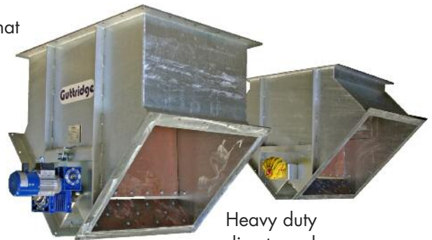
Heavy duty diverter valves

Guttridge slide valves, spouting & fittings are in use in many different industry sectors handling a huge variety of bulk materials.