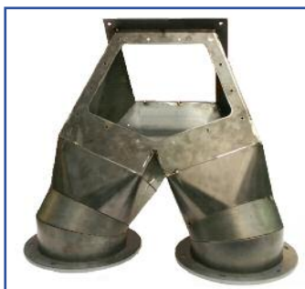
Branch spout with access door