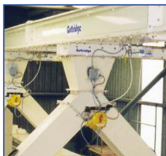
Shrouded Chain Conveyor with slide and diverter valve